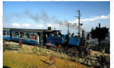
DARJILING TOY TRAIN