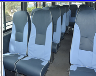
Tempo Traveller Seat